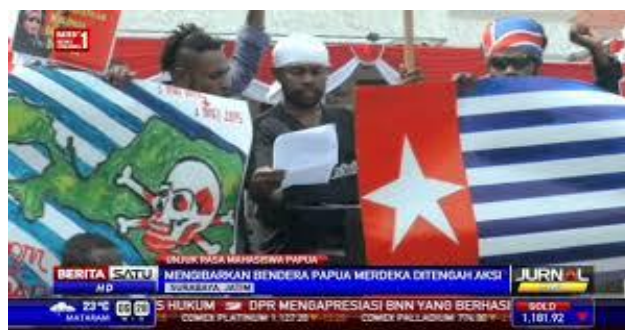
Photo 1, 2: Demonstrations of Papuan students for the independence of Papua and West Papua provinces